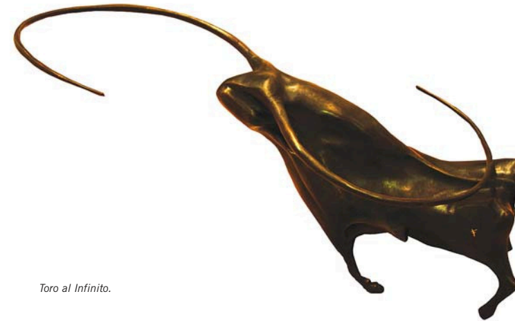
Toro al Infinito.